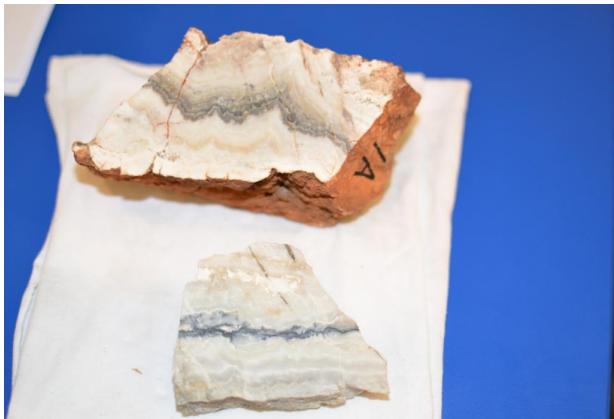
And a sample from Kin – this contains free gold